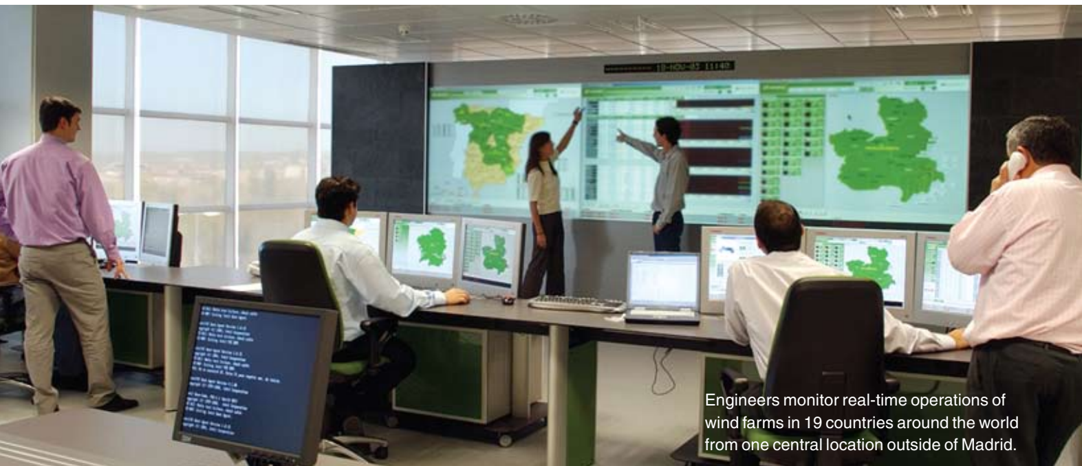
Engineers monitor real-time operations of wind farms in 19 countries around the world from one central location outside of Madrid.

mous University of Barcelona and the Spanish Council for Scientific Research, focused on reducing energy loss and increasing transmission capacity in the grid.