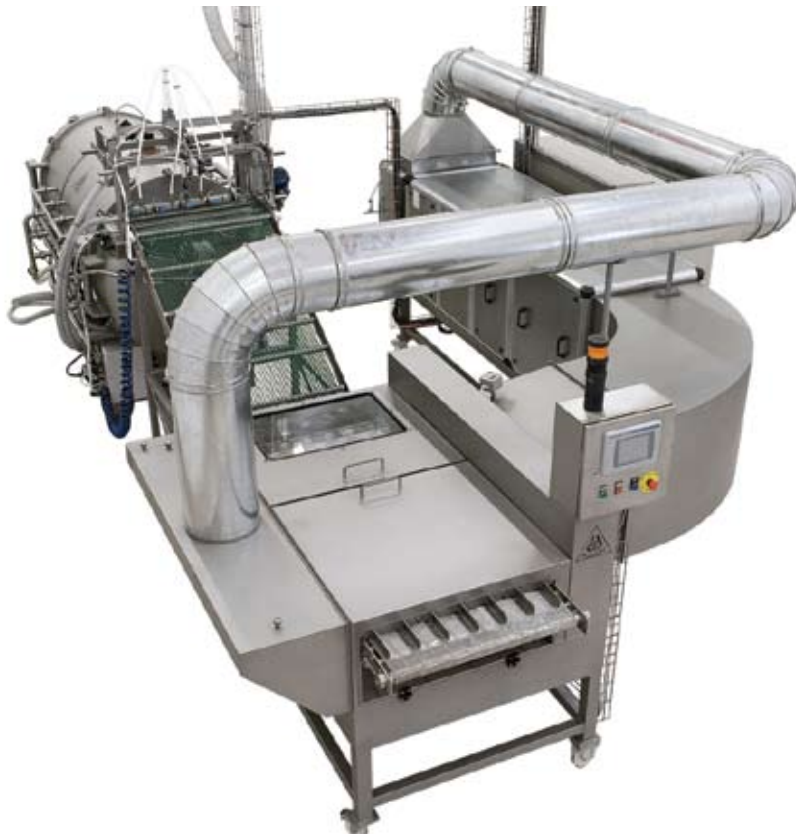
NC Hyperbaric’s high-pressure chambers pasteurize food without heat.

“Traditionally, foods were processed by thermal methods to make them safer for